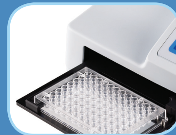
Robot-friendly plate carrier for both 96- and 384-well plates