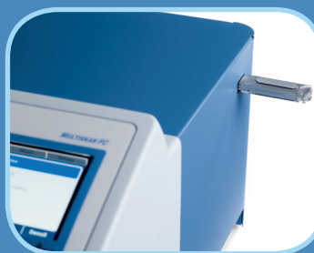
USB port for easy data transfer

Applications: Immunoassays (ELISA), protein assays, endotoxins, cytotoxicity and proliferation assays, enzyme assays and growth curves