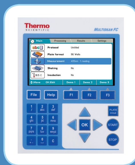
Large color screen and visual internal software

Applications: Immunoassays (ELISA), protein assays, endotoxins, cytotoxicity and proliferation assays, enzyme assays and growth curves