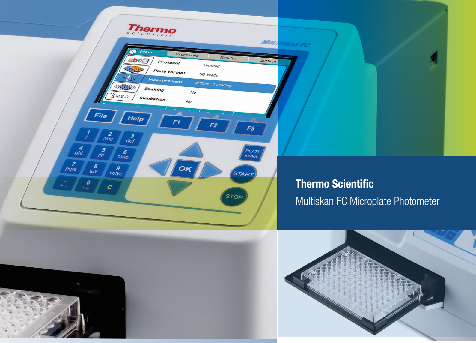
Thermo Scientific Multiskan FC Microplate Photometer