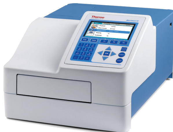
Multiskan FC microplate photometer

The large color screen of the Multiskan FC, combined with the simple and logical internal software, ensures easy and intuitive assay setup. The 'quick keys' allow instant access to the most commonly used protocols in routine laboratories. In addition, the internal software contains both qualitative and quantitative calculations for single, dual and kinetic measurements providing flexible data handling capabilities.